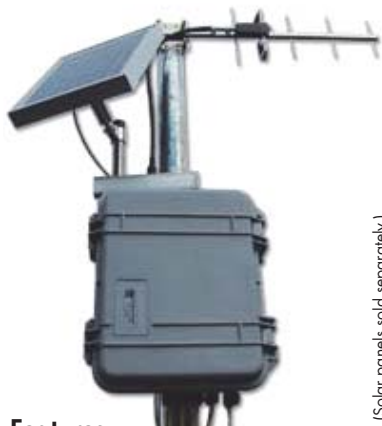
(Solar panels sold separately.)